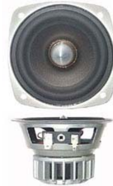
3" PAPER FULL RANGE