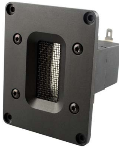
NeoCD1.0 true ribbon tweeter