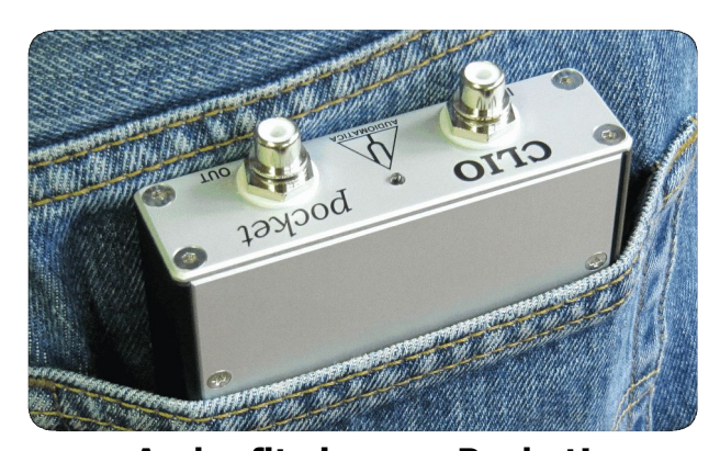
And... fits in your Pocket!

CLIO Pocket is a powerful, rugged and lightweight portable measurement system.